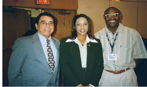
Remembering Dr. Martin Luther King Jr.